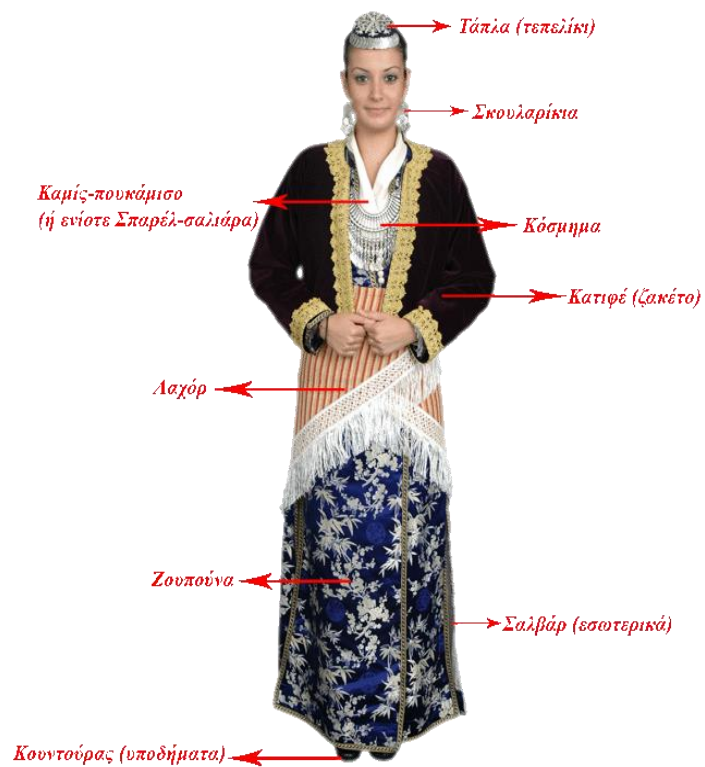
Female traditional costume from Pontus (pic4)