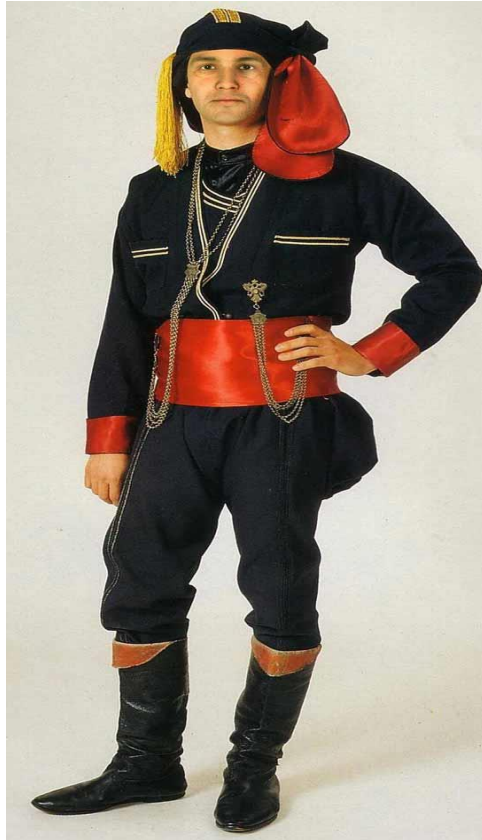
Male traditional costume from Pontus (pic5)