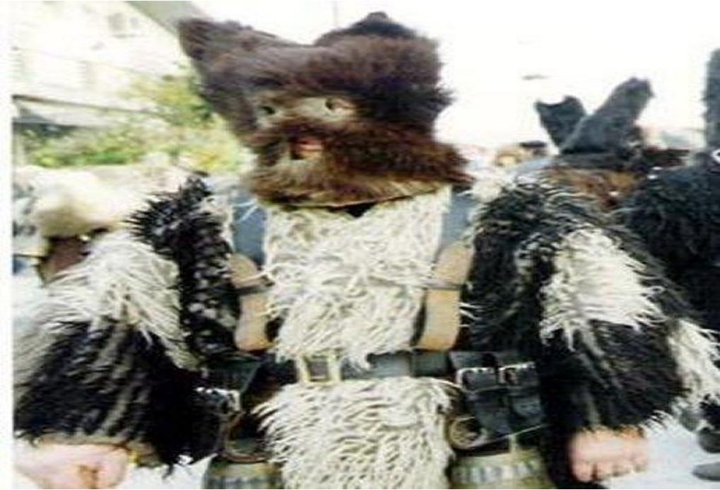
Arkoudes traditional festival (pic7)