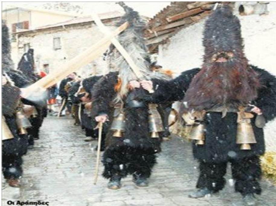
Arapides traditional costumes (pic8)