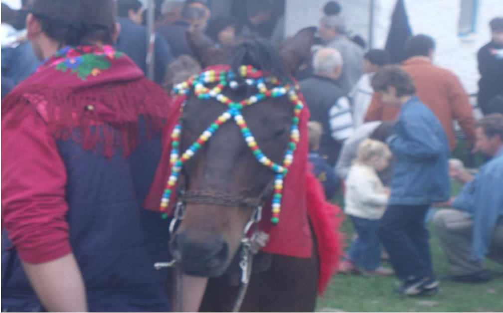
Traditional festival of Holly Spirit day (pic9& 10)