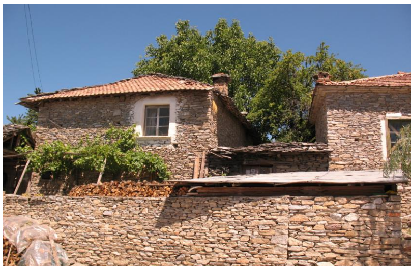
A stone house in Godeshevo village.