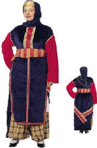
Female Costume (pic1)