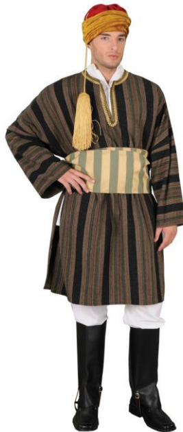
Male Cappadocian Costume (pic2)