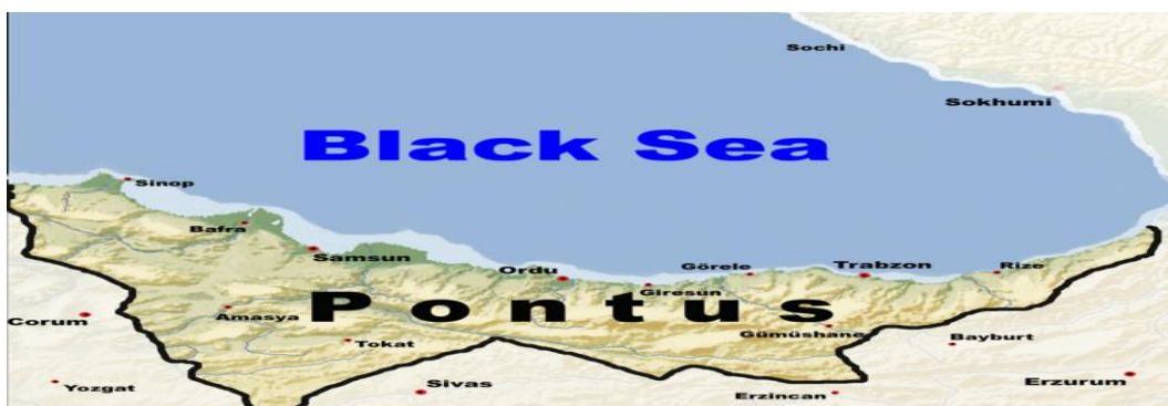
Map of Pontus Region

The Pontic Greeks known and as Pontian Greeks is an cultural group who traditionally lived in the region of Pontus, on the shores of Turkey's Black Sea and also Crimea region which referred to as 'Northern Pontus' which Pontus proper 'South Pontus', together unite Pontian Greeks as a whole. The Populations at the black sea region spoke the Pontic Greek dialect, a form of the standard Greek language which, due to the remoteness of Pontus, has had a process of linguistic evolution different from that of the rest of the Greek world. The Pontic Greeks have had a continuous presence in the region of Pontus from at least 700 BC until the population exchange at 1922.