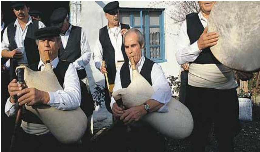
Traditional costumes from Volakas (pic6)