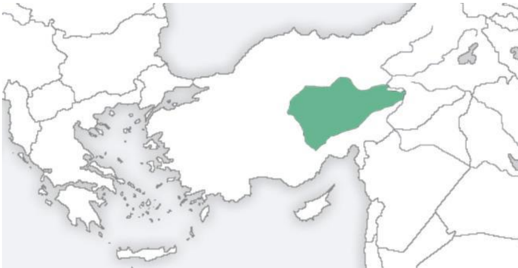
Map of Cappadocia

Their culture has been strongly influenced by the topography of its different regions. The Cappadocian Greeks have distinctive traditional songs and dances which are still performed in the municipality of Kato Nevrokopi and other areas of Northern Greece.