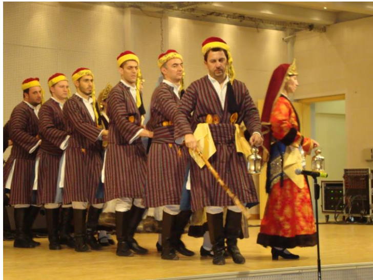
Traditional dance Cappadocia (pic3).