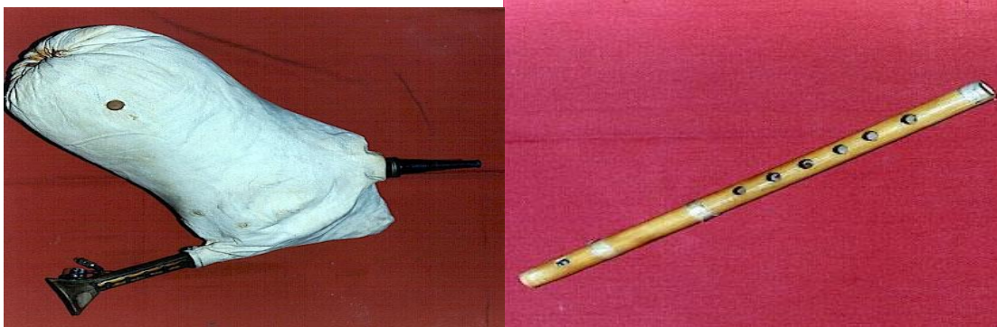
Aggion or Touloum